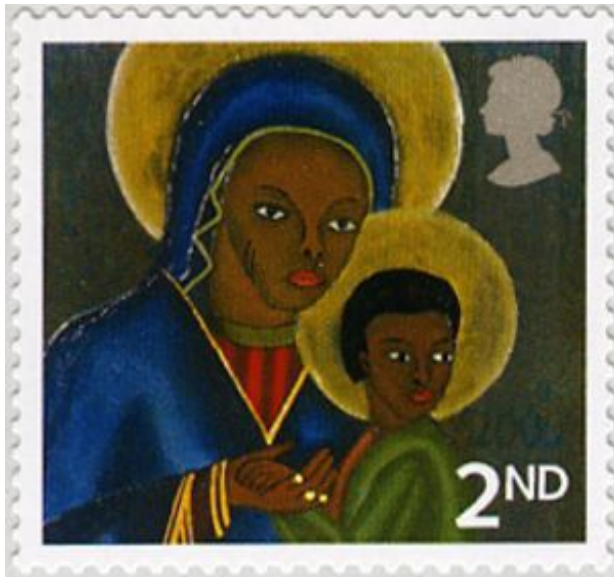
United Kingdom of Great Britain & Northern Ireland Christmas 2005 - Madonna and Child Painting from Haiti Commemorative Stamp