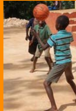
Milwaukee Bucks send 30 team basketballs to Haiti with July trip. Basketball clinic was very popular with children and adults alike.